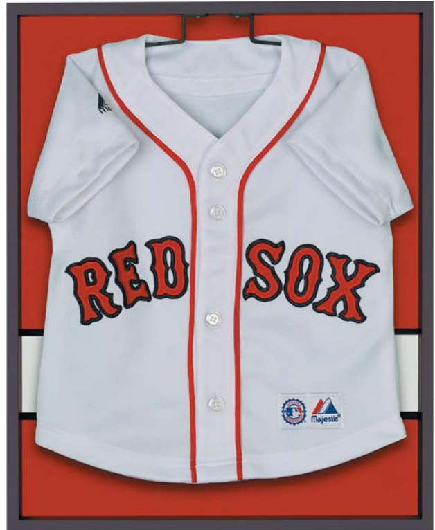
A 32"x40" display case provides a unique shadowbox system with a front-loading magnetic panel that allows easy access to the contents. White inlaid mats were placed in back of the jersey to customize the presentation.

So come in with those ticket stubs, programs, and banners. Or bring in your child's soccer jersey from the winning season. Perhaps you have a signed sneaker from a basketball player. We will create the perfect home for your treasured memories of exciting sporting events. ■