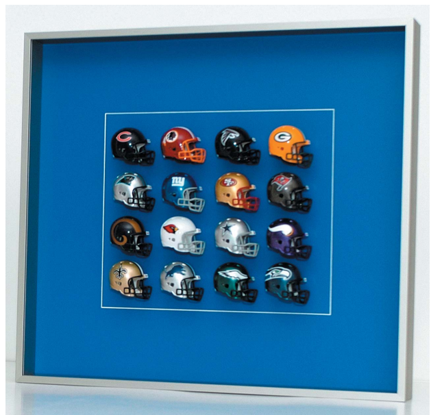
The NFL football helmet collection is framed using a white V-groove as a design element.